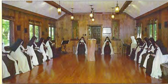
Current Port Tobacco Community of Nuns

Through the efforts of the Restorers the monastery was placed on the National Register of Historic Places on December 1, 1973. Three weeks later, a group of Carmelites did arrive in Maryland, at Great Mills, and with the support of the Archdiocese of Washington, the wish to move the nuns to Port Tobacco became a reality in 1976. After 145 years since their departure in 1831, the Discalced Carmelite nuns came Home.