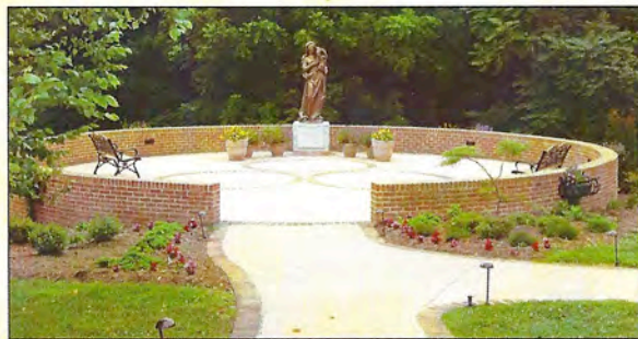
Mary's Prayer Garden

For more than 75 years the Restorers have continued their dedication to Mount Carmel and the Carmelite nuns by their spiritual, physical and financial support. We invite you to join the Restorers of Mount Carmel of Maryland, Inc., by completing the membership form and assisting us in our efforts to create awareness of this important site of religious freedom in the State of Maryland.