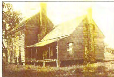
The Old Carmel 1935

The first pilgrimage to the Shrine was in 1936 and the first Mass was celebrated in June 1937. Chapters of the Restorers were established in Washington, DC, Boston, Charles County, MD, Saint Mary's County, MD, and New York City to permanently maintain Mount Carmel as a priceless relic of Catholic religious life.